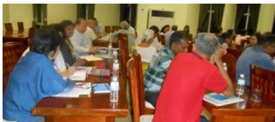
Participants reflect on their concerns and expectations