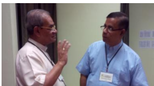
Archbishop Patrick in discussion with Bishop Andradi

There was a general feeling that the objectives were too broad for such a short conference. Less ambitious and more specific was the feedback on the objectives. However, to some degree, all the objectives were met and with the final statement completed, objective D will also be accomplished.