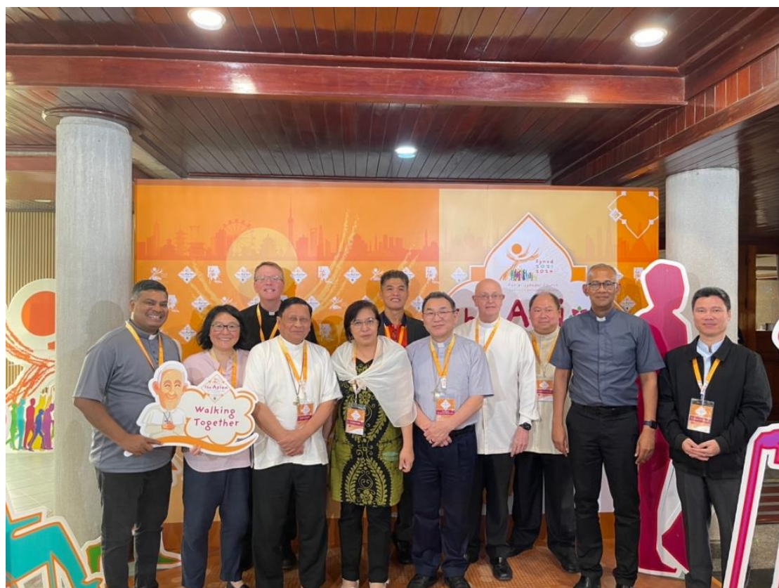
Cardinal Charles Maung Bo, SDB (Myanmar) President of FABC